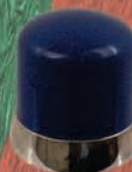
225 - Plain 24/410 (Non-Dispensing)