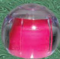
241 - 24/410 (Non-Dispensing)