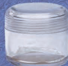
4 Fl. Oz. 63mm