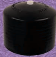
204 - Push Pull 8 oz (Dispensing w/Rings)