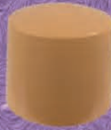
201 - Plain 4 oz (Non-Dispensing)