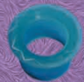
VENTING SLEEVE (VT.ZZS.24.003)