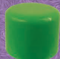
207 - Plain 8 oz (Non-Dispensing)