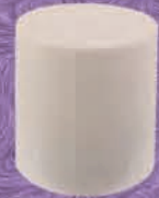
223 - Plain 2 oz (Non-Dispensing)