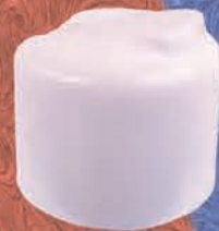
900 Gentle Radius Disc 24/410 (Dispensing)

SEALS Foil Liners, Pressure Sensitive, Induction Foil, and Induction Pull Tab Foil Available