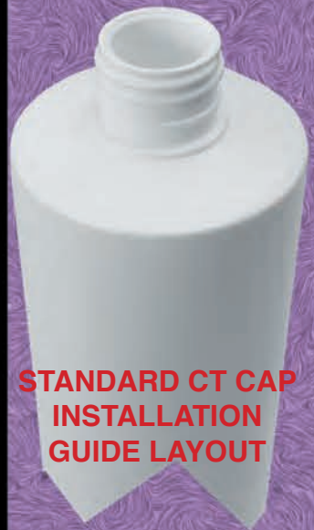
STANDARD CT CAP INSTALLATION GUIDE LAYOUT