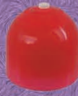
222 - Push Pull 4 oz (Dispensing w/Rings)