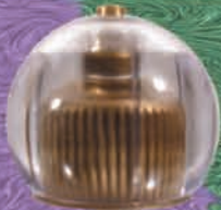
240C - Push Pull 24/410 (Dispensing)