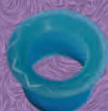
VENTING SLEEVE (VT.ZZS.28.005)