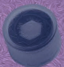
VENTING CT CAP