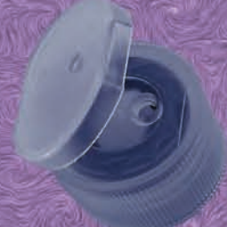
VENTING FLIP CAP