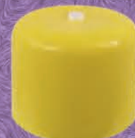
221 - Push Pull 8 oz (Dispensing)