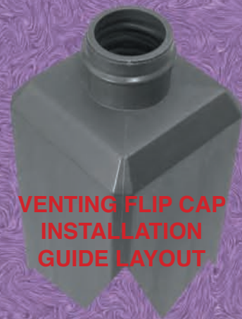
VENTING FLIP CAP INSTALLATION GUIDE LAYOUT