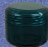
20ml / 1 oz