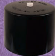
212 - Push Pull 8 oz (Dispensing)