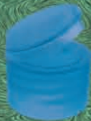
602 Flip Cap 28/410 (Dispensing)