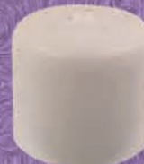
227 - Push Pull 4 oz (Dispensing)