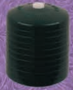
205 - Push Pull 2 oz (Dispensing w/Rings)