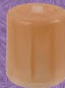
210 - Push Pull 2 oz (Dispensing)