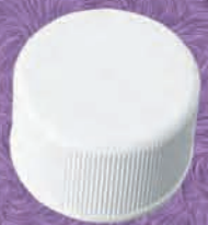
STANDARD CT CAP