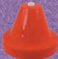
218 - Push Pull 8 oz (Dispensing)

ALL DISPENSING CAPS AVAILABLE WITH VENTED TECHNOLOGY EXCEPT 900 SERIES