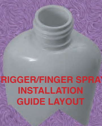
TRIGGER/FINGER SPRAY INSTALLATION GUIDE LAYOUT