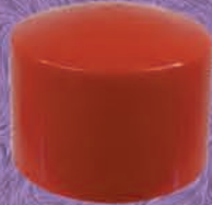
200 - Plain 8 oz (Non-Dispensing)