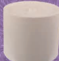
214 - Push Pull 8 oz (Dispensing)