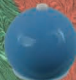
240 - Push Pull 24/410 (Dispensing)