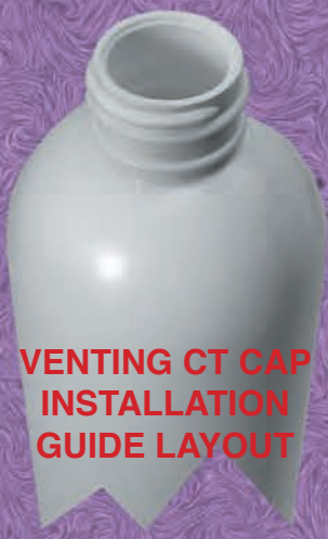
VENTING CT CAP INSTALLATION GUIDE LAYOUT