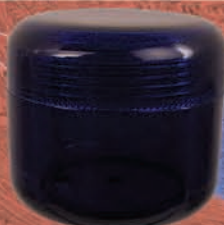
90ml / 4 oz