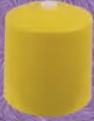
203 - Push Pull 2 oz (Dispensing)