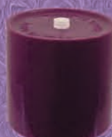
216 - Push Pull 4 oz (Dispensing)