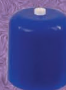
220 - Push Pull 2 oz (Dispensing)