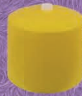
217 - Push Pull 4 oz (Dispensing)