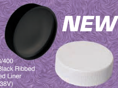
38/400 White or Black Ribbed Vented Liner (938V)