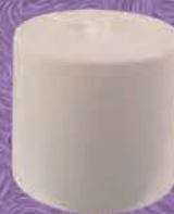
219 - Push Pull 4 oz (Dispensing)