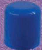
213 - Plain 2 oz (Non-Dispensing)