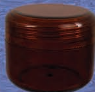
40ml / 2 oz