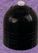
211 - Push Pull 2 oz (Dispensing w/Rings)