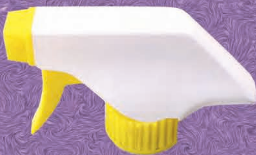
STANDARD TRIGGER SPRAY