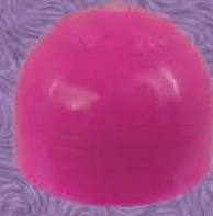
206 - Push Pull 8 oz (Dispensing w/Rings)