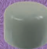
215 - Plain 4 oz (Non-Dispensing)

ALL DISPENSING CAPS AVAILABLE WITH VENTED TECHNOLOGY EXCEPT 900 SERIES