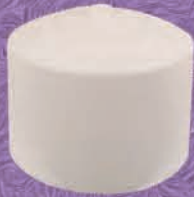
202 - Push Pull 8 oz (Dispensing)