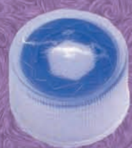
VENTED CT CAP (VT.ZZC.24.410.003)