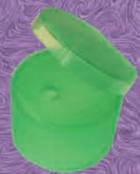
FLIP CAP (VT.ZZFC.24.410.005)