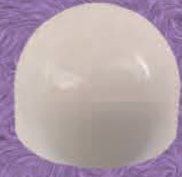
208 - Plain 8 oz (Non-Dispensing)