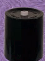
224 - Push Pull 2 oz (Dispensing)